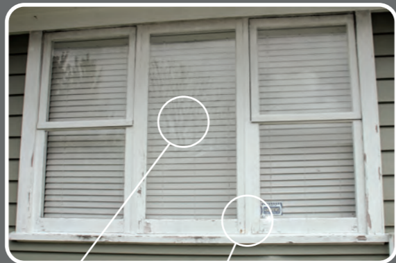
● Heat Loss ● Constant repainting

There is no need to repaint the frames - the Aluminium stays looking new for years and there is no rotting. Together with double glazing exterior noise is reduced, your home's efficiency is increased and condensation is controlled resulting in a healthy, warm, damp-free home.