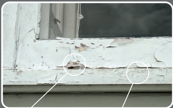
● Water seeping into walls and leaking onto window ledges ● Rotten frames

Windows like these are both unhealthy and inefficient creating a cold, damp house. The timber frames look tacky when the paint is peeling and in the long-term leads to rotting windows. Replacing your windows with Aluminium frames greatly reduces the ongoing maintenance.